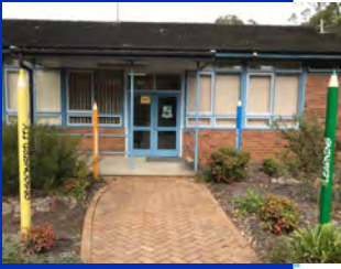
School Office Entrance