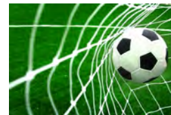
Soccer Ball & Net