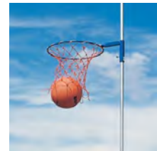
Netball & Hoop